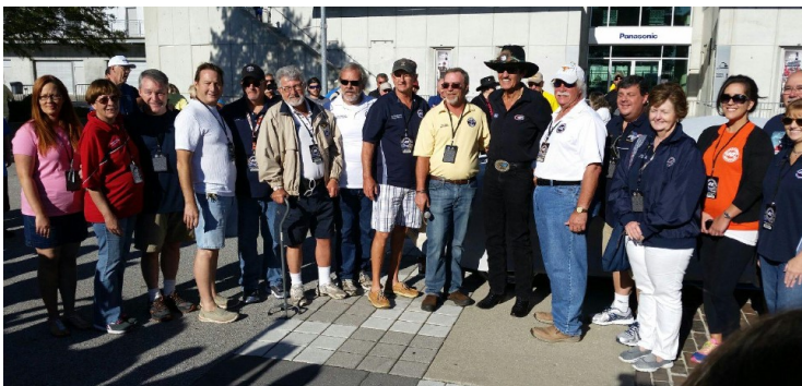
MCA Board presenting honorary membership to Richard Petty